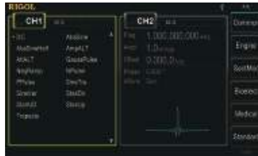
Standard arbitrary waveform function and 150 built-in arbitrary waveforms