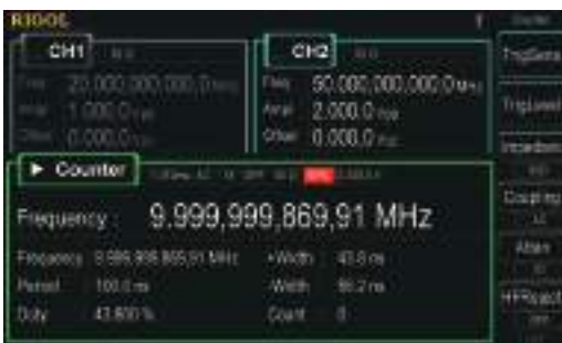
Standard high resolution counter function