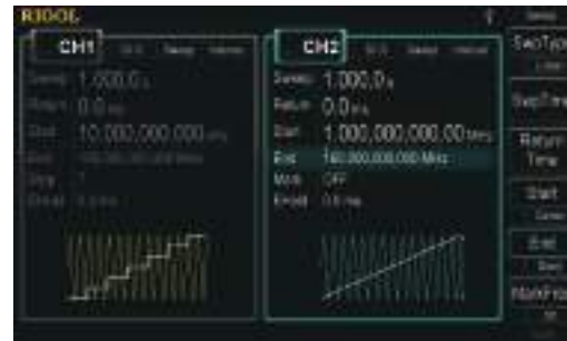
Various sweep modes