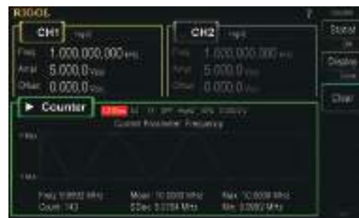
Statistic analysis function of counter