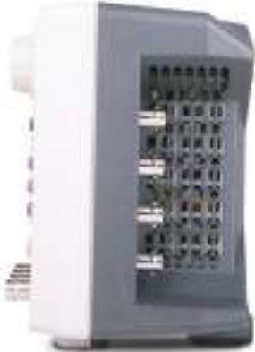
Product Dimensions: Width x Height x Depth = 313mm x 160.7mm x 116.7mm Weight: 3.2kg (Without Package)