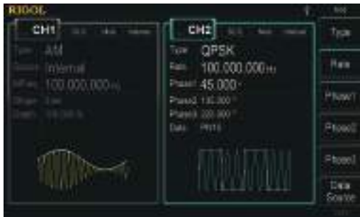
Abundant analog and digital modulation functions