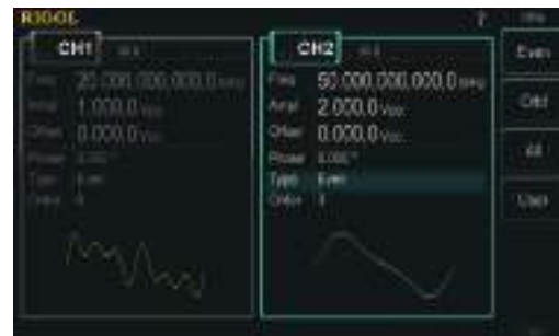
Up to 16 orders customized harmonic generation function