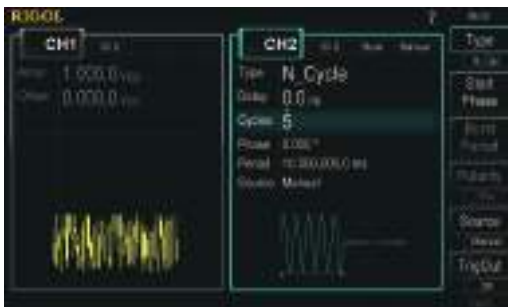
Noise and burst modes