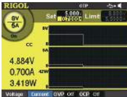
V/A/W Waveform Display