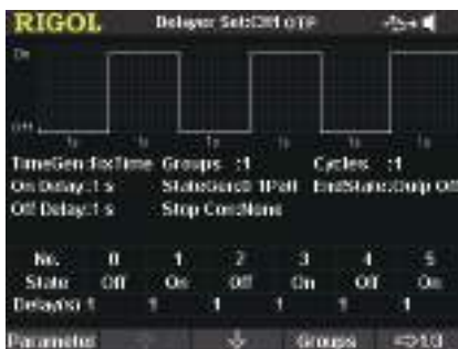
Output On/Off Delay