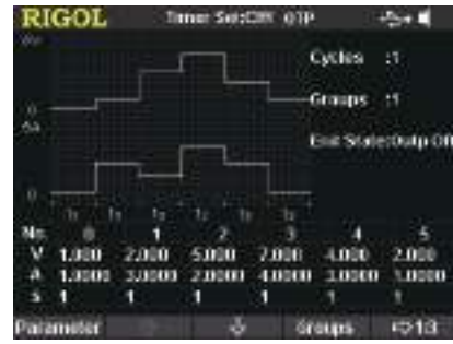
Timing Output Setting